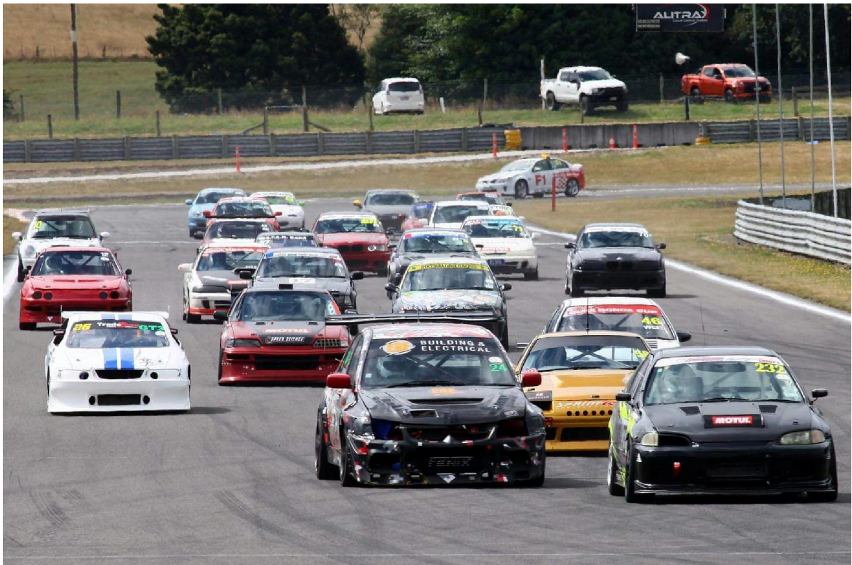
Improved Production Cars Taupo

Facebook HRCEventsNZ Facebook New Zealand Racing Drivers League