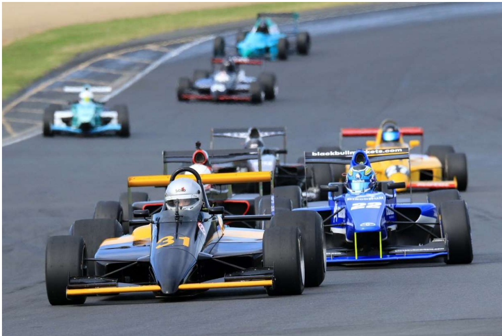
Formula Open - The Fastest growing single seater class in NZ

Facebook HRCEventsNZ Facebook New Zealand Racing Drivers League