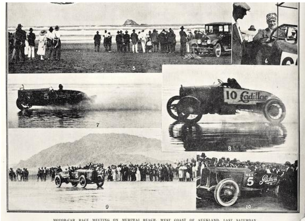
MOTOR-CAR RACE MEETING ON MURIWAI BEACH, WEST COAST OF AUCKLAND, LAST SATURDAY.

Note our celebration of 100 years of the New Zealand Motor Cup at Muriwai has been rescheduled for 26 November 2021 and is sponsored by Pinepac, Kumeu Medical Centre, MSNZ, HRC and NZIGP.