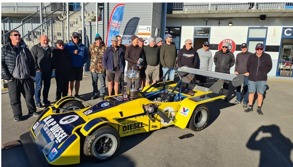
Sports car drivers and SID Mk 3

The Season Finale meeting 15/16 th May Hampton Downs is the last HRC meeting of this season. As usual we have a full two day program with classes having the choice of running either day or both days. On Saturday we have Formula Open/Libre, Improved Production Cars, Classic Trial. Sunday features 2KCup, Classic Touring Cars, Hooters Vintage series including the Roycroft Cup and over both days Super Laps and Super Karts. Remember you can race in more than one class subject to eligibility for an extra $100 for double the track time.