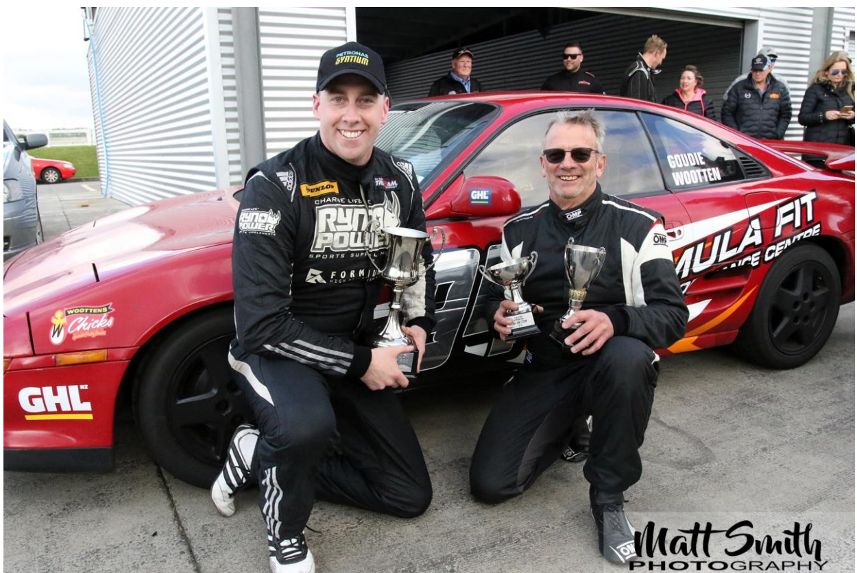
2019 B&H500 Winners