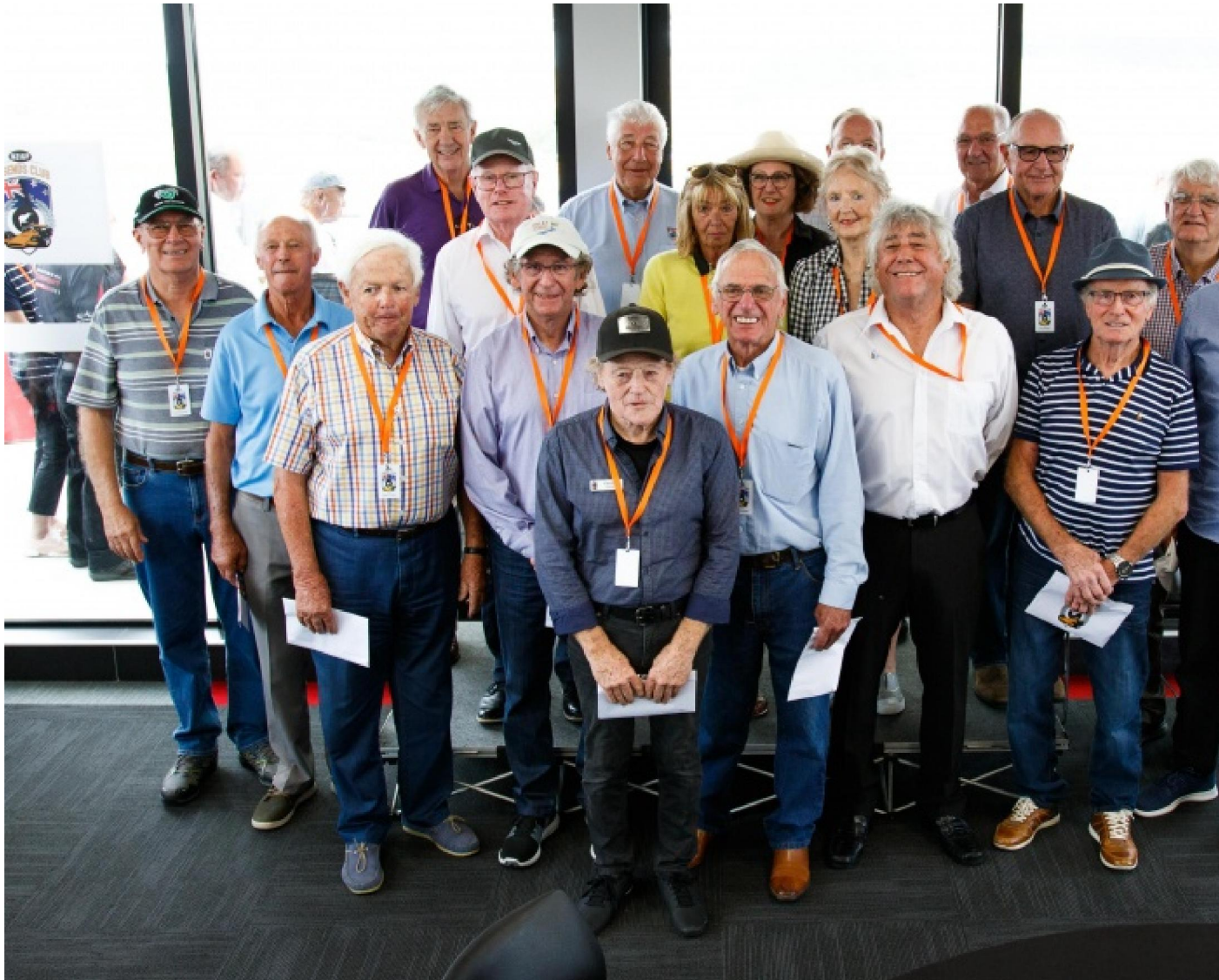
Willmott and legends of New Zealand motor racing at the New Zealand Motor Cup meeting

The team built and ran two 2.5-litre Cooper race cars in England, which were shipped to New Zealand for the series. McLaren and American driver Timmy Mayer raced them.