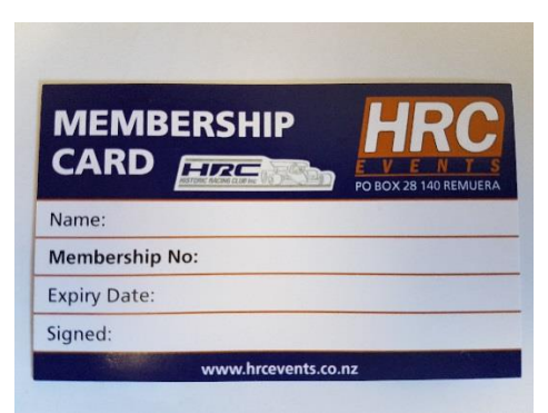
Are you a member of HRC?

If you would like to become a member of the Historic Racing Club, please fill out the form available on our website or order online at <u>www.hrcevents.co.nz/shop.php</u> for a small payment of $50.00. You can pay by cheque, credit card, direct credit or cash. We are MSNZ affiliated and under that we administer, promote, and develop automobile sport in accordance with the objectives of MSNZ.